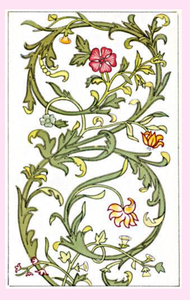
Extract from the Handbook of Embroidery by L.Higgin